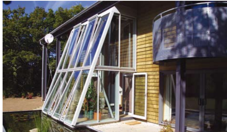
Featured Project. Wood Lane House, Truro