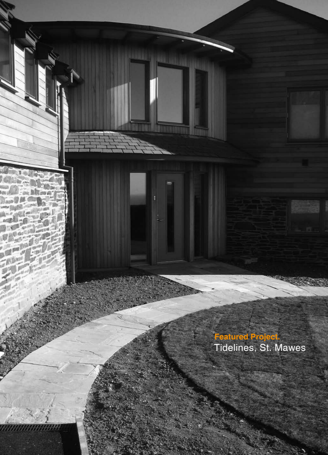
Featured Project. Tidelines, St. Mawes